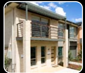
Newleaf Communities (Bonnyrigg) Stage 1