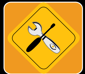
Emergency Repairs & Maintenance