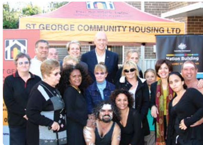
Residents, SGCH staff and special guests.

The new property is 13 units and villas and is SGCH's first property to be handed over as part of Stage 1 of the Nation Building Economic Stimulus Plan. Residents of O'Connell Avenue have already formed friendships and support networks together.