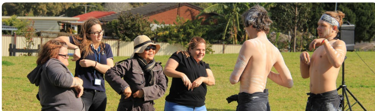
Bonnyrigg residents and SGCH staff learn how to tell a story through dance.