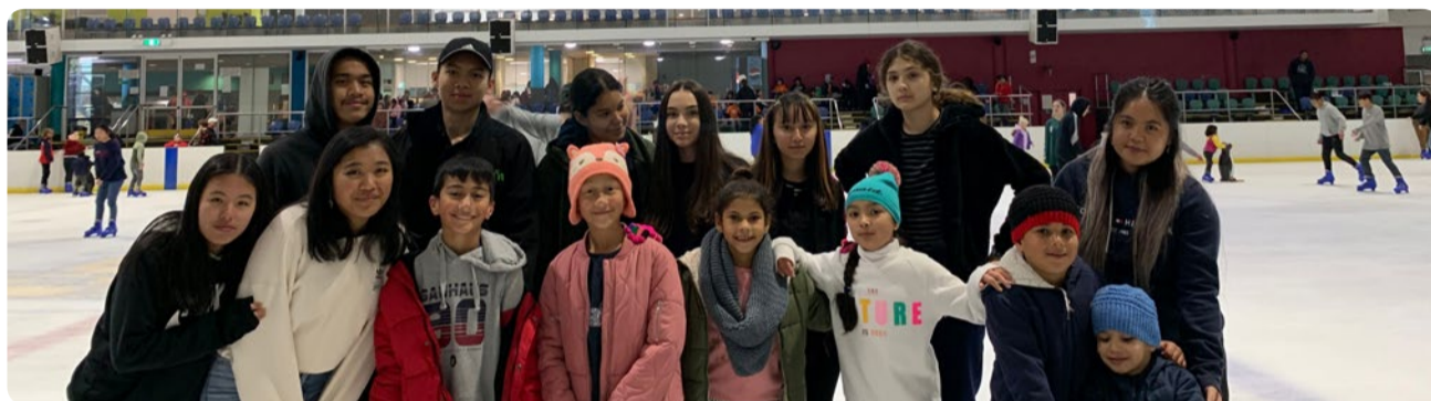
Local residents enjoyed some school holiday fun at our annual ice-skating event.

Most importantly, a huge thank you to everyone who attended and helped make the day fun and friendly.