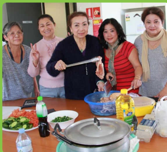
Our Flavours of South East Asia share their cultural dishes.

FOSEA welcomes new members. If you're interested in joining, please contact GetInvolved@sgch.com.au or call the Communities, Place and Partnerships team on 9585 1499.