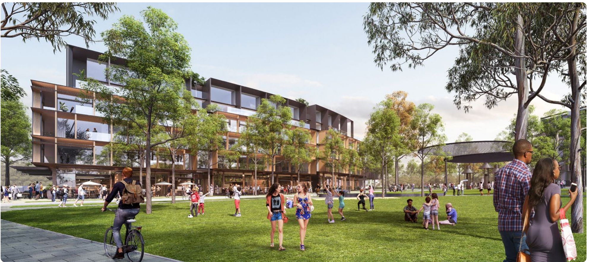
Artist impression of the village green which will form part of a new town hub