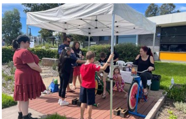
Our Bike Smoothie was a huge hit on the day.