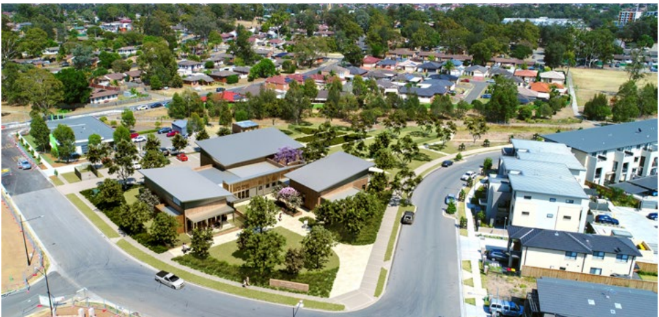
Community building aerial render

This new town hub, (02 on the map next to the Bonnyrigg Plaza) will become the focal point for residents, including cafes and outdoor dining areas.