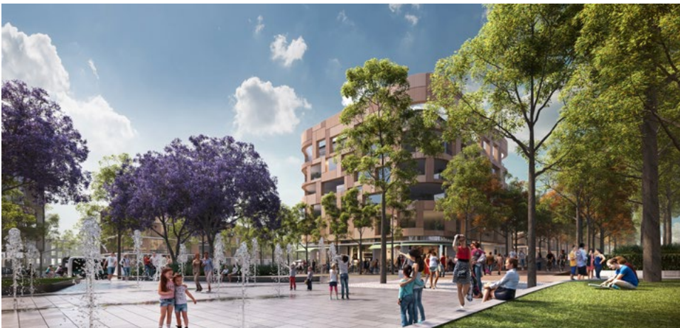
The majority of homes to be built from stage 12 onwards are 1 and 2 bedroom apartments