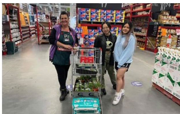
Thank you Bunnings for donating 50 potted plants for our attendees.

The smoothie bike was also a big hit with 100 smoothies completed within the first 1.5hrs of the event.