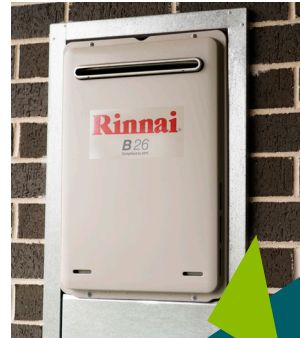
Gas hot water unit.

Individual meters are located in the common area. Only SGCH and service providers can access these meter cupboards.