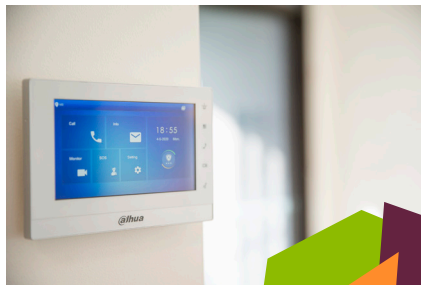
Video intercom panel.

Your visitors will need to press your unit number and then the bell symbol to call your unit. When you hear your door buzzer, you can check on the video display the location of your guest and let them in. Your guests will only be able to access your floor.