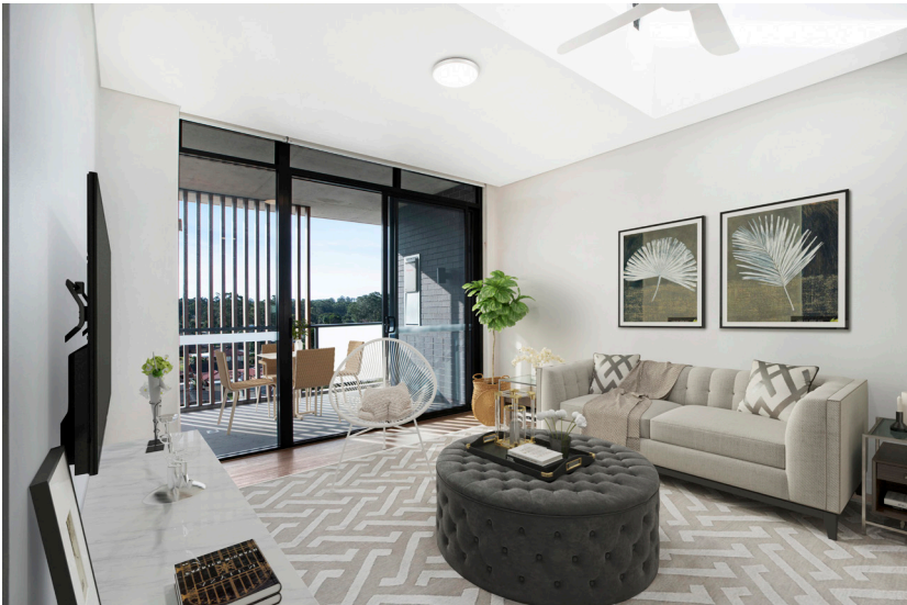
Living area and sliding doors to balcony.

We hope you enjoy living at Cabramatta Avenue, Miller, and being a customer of SGCH.