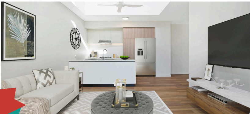
Kitchen and living area.

Kitchens have gas cook tops, electric fan forced ovens and an overhead rangehood. Instructions on how to use these appliances are supplied in each unit. There is a space for a dishwasher. If you would like to install one at your cost, please contact us for an alterations request form.