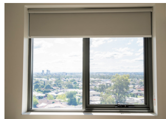
Windows with blinds.

Units have fly screens on all windows and screen doors to the balcony. Windows are fitted with solid blinds and child safety clips to make sure the chain does not come away from the window frame.