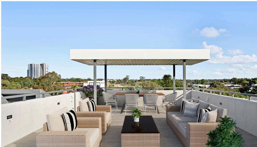
Roof top common area

For general safety and fire evacuation purposes, it is important that hallways and stairs are kept clear. No personal items are to be left in the common area walkways and fire stairs. If you see anything blocking these areas, please report it to your tenancy manager as soon as possible.