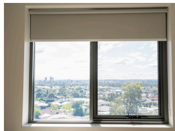
Windows with blinds.

Units have fly screens on all windows and screen doors to the balcony. Windows are fitted with solid blinds and child safety clips to make sure the chain does not come away from the window frame.