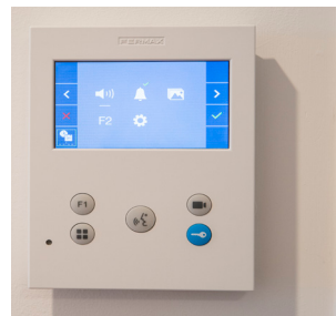
Video intercom panel.