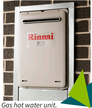
Gas hot water unit.

Individual meters are located in the common area. Only SGCH and service providers can access these meter cupboards.