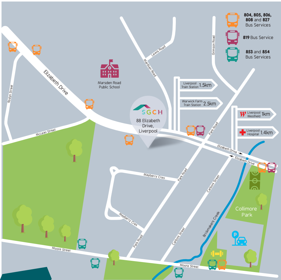
88-92 Elizabeth Drive, Liverpool and key transport options.