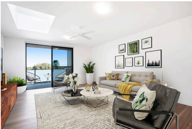
Living area and sliding doors to balcony.

We hope you enjoy living at 88-92 Elizabeth Drive, Liverpool and being a customer of SGCH.