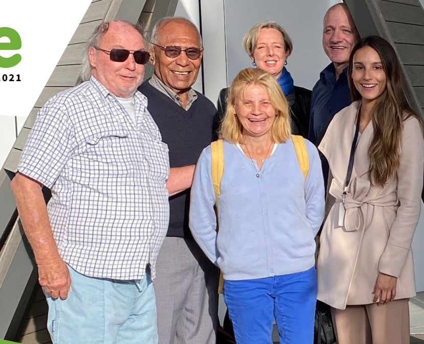
Members of the Tenant Coordination Panel visit Gibbons Street