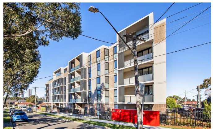
Pictured: Exterior of Flowerdale Road, Liverpool