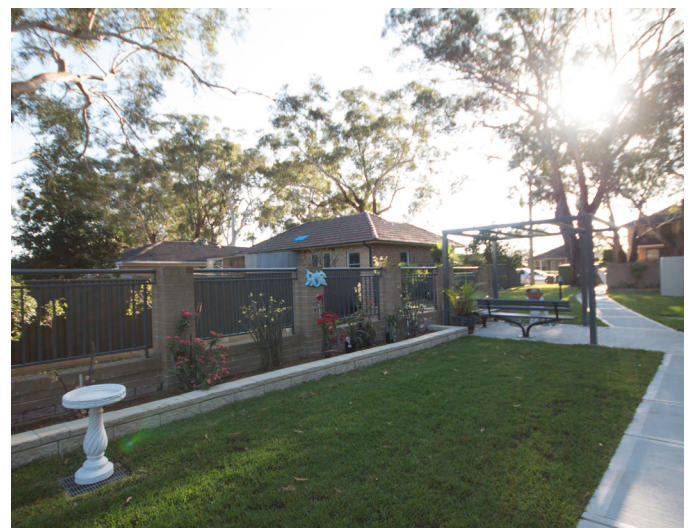
Pictured: Completed works at GyMEA.