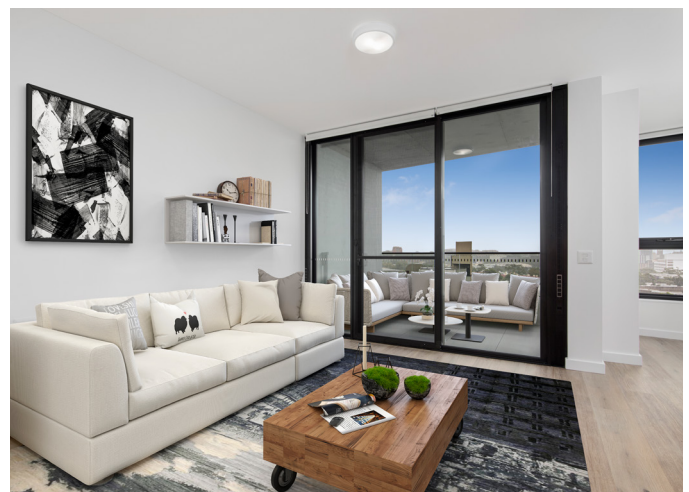
Pictured: Interior of apartment at Gibbons Street, Redfern

The team at Redfern are still taking applications for the affordable homes and can be reached at gibbons@sgch.com.au