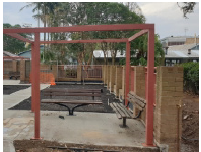
Pictured: Works in progress at GyMEA.