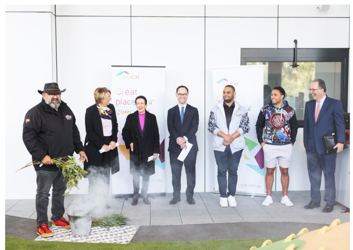
Pictured: Official opening event at Gibbons Street, Redfern