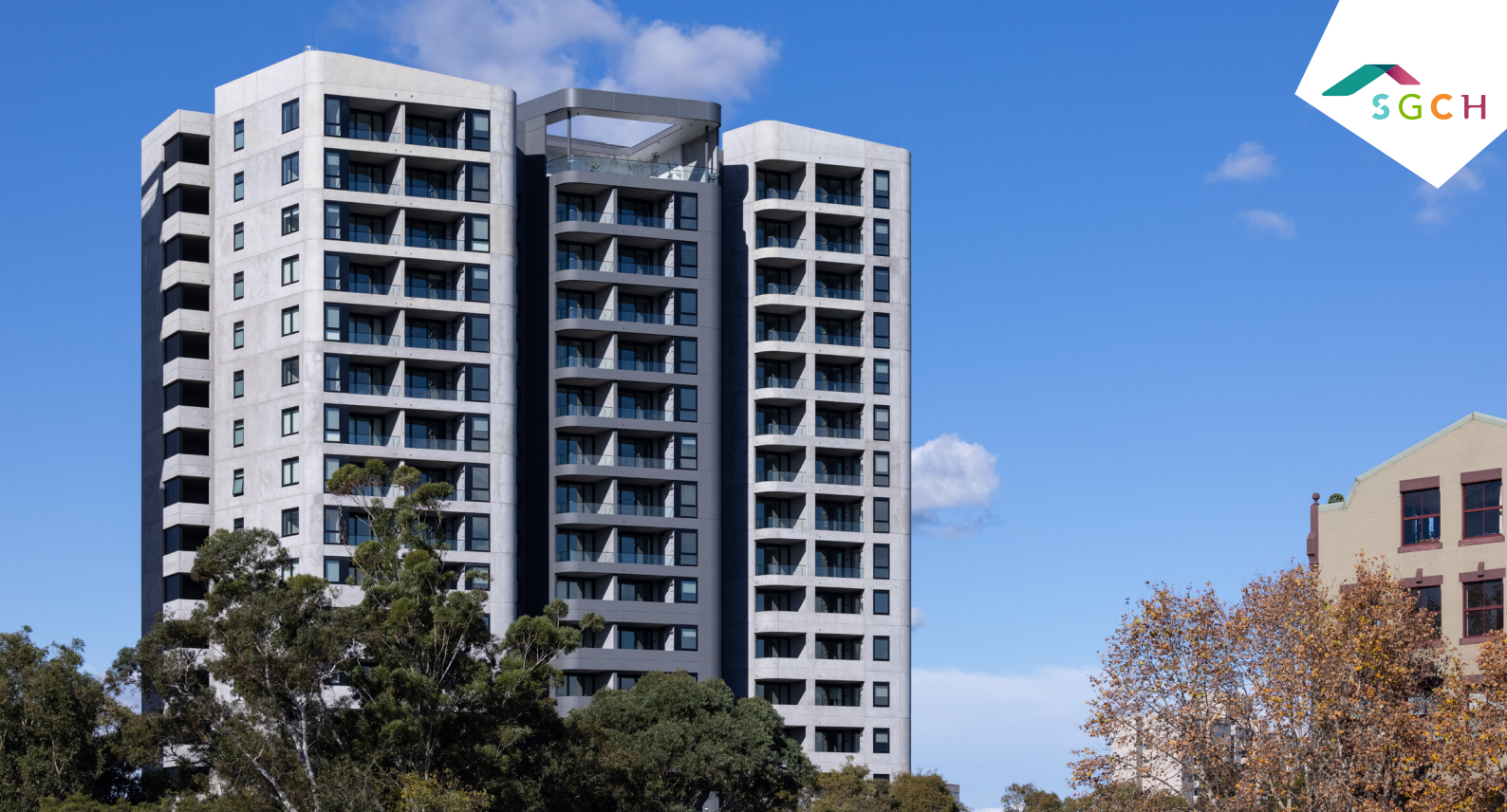
Pictured: 11 Gibbons Street, Redfern