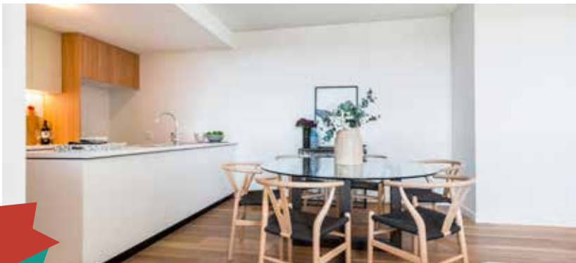
Kitchen and dining area.

Kitchens have gas cook tops, electric fan forced ovens and an overhead rangehood. Instructions on how to use these appliances are supplied in each unit. There is a space for a dishwasher. If you would like to install one at your cost, please contact us for an alterations request form.