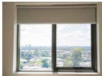
Windows with blinds.

Units have fly screens on all windows and screen doors to the balcony. Windows are fitted with solid blinds and child safety clips to make sure the chain does not come away from the window frame.