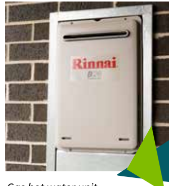
Gas hot water unit.

Individual meters are located in the common area. Only SGCH and service providers can access these meter cupboards.