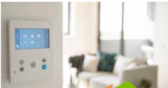
Video intercom panel.

Your visitors will need to press your unit number and then the bell symbol to call your unit. When you hear your door buzzer, you can check on the video display the location of your guest and let them in. Your guests will only be able to access your floor.