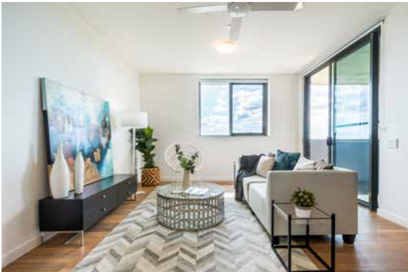
Living area and sliding doors to balcony.

We hope you enjoy living at 87 Nuwarra Road, Moorebank, and being a customer of SGCH.