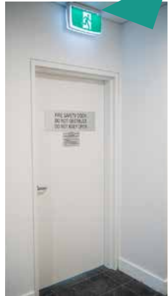
Fire stairs on each level.

Each unit is fitted with sprinklers and a hard wired smoke detector and fire detector. Sprinklers will be activated when there is a fire, and only impact the room/unit where fire is located. If sprinklers are activated in any area of the building the fire alarm will sound and tenants will hear instructions to evacuate. The fire brigade will also attend.